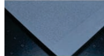
INDUSTRIAL INKJET SOLUTIONS