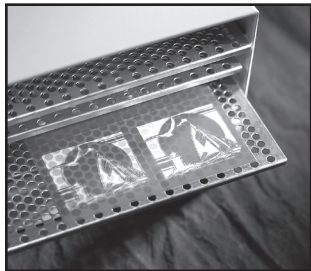
A dryer, such as the PB 500 (shown) with heated circulating air will significantly reduce drying time.

100°F (39°C), drying will take approximately 20-30 minutes. For best results, return to room temperature before applying.