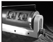
IKONICS Imaging for additional exposure times.

NOTE: Exposure times are suggested only as a guide. All exposure times are approximations and will vary based on type of UV light source used, age of light source, and local voltage ranges. Exposure times can also vary based on type of photopositive used. Contact