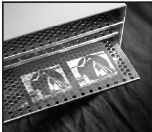
A dryer, such as the PB 500 (shown) with heated circulating air will significantly reduce drying time.

100°F (39°C), drying will take approximately 20-30 minutes. For best results, return to room temperature before applying.